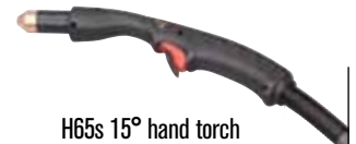
H65s 15° hand torch